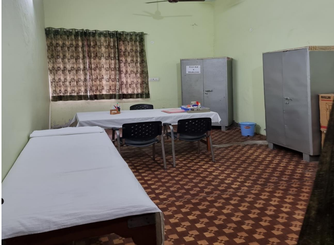
First Aid Room