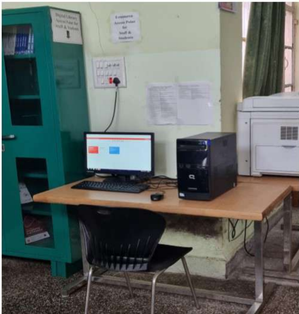
E Resource Access Point