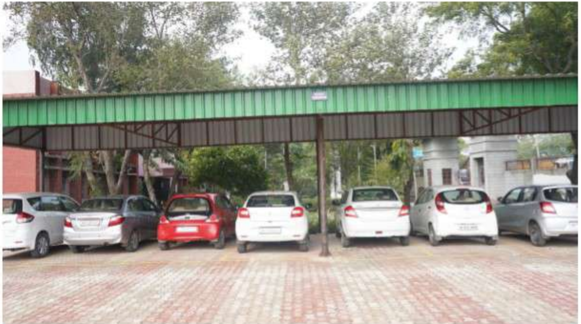
Parking Area with Shed