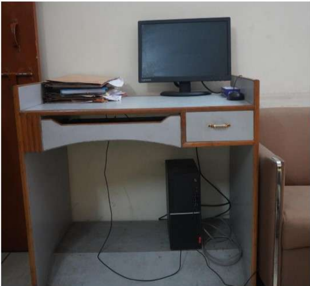
PC with Internet Connection